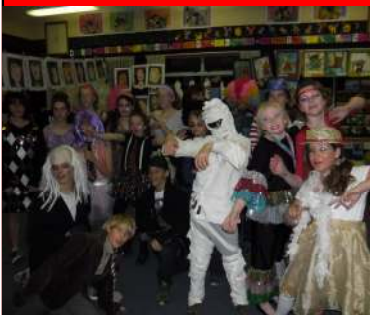
Rm 18 just before heading on stage