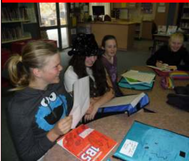
Extension writers enjoying each others work