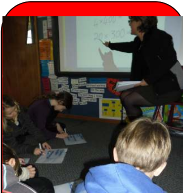
Group maths using an IWB and personal whiteboards

What do you like most about Arrowtown School?: Friendly children, staff and community