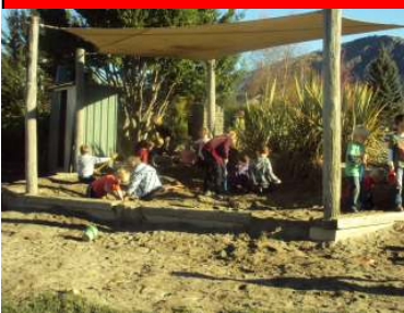
The covered sandpit - always popular