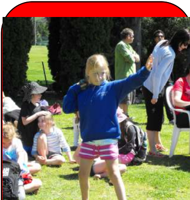
Superb shotput technique!

Remember to check out all info on the sports blog - http://arrowsports.blogspot.com/