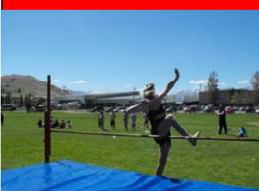
The high jump, always a great challenge.